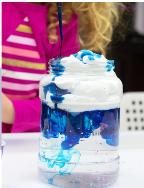
Rain Cloud in a Jar Science Experiment

https://funlearningforkids.com/rain-cloud-jar-science-experiment/