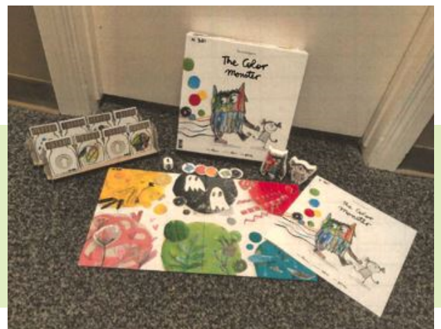
Color Monster Game 4-321