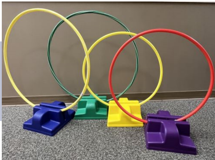
Hoola Hoops With Stands 4-123 and 4-124