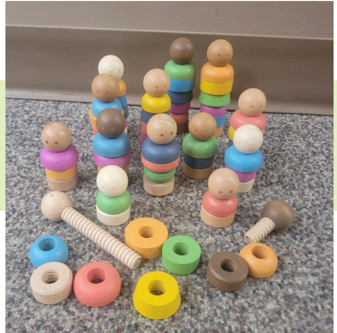
Rainbow Wooden People 4-121