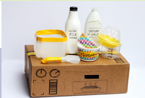
DIY MUD PIE KIT Made from Recyclables