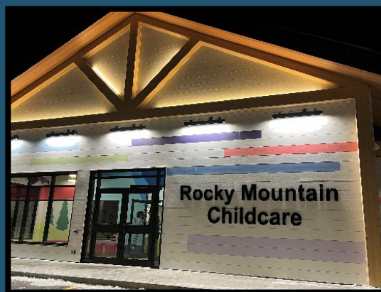
An Open House was recently held at Rocky Mountain Childcare, adjacent to Marysville Elementary School, to celebrate the completion of the new facility.