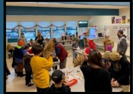
Learners and caregivers participate in a recent Schoolwide Activity Time at Lady Grey Elementary School.

These events involve students and staff across all grade levels and provide an opportunity for students to interact with peers from a variety of age groups and social circles. These activities have helped to create a sense of belonging among students and contribute positively to the overall school culture.