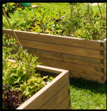
Rocky Mountain School District has established many partnerships this year in support of food security.

Within the district’s priority area ‘Stewardship for the Future’, there is a clear emphasis on collaborating with community partners to enhance food security in 2024-25. Significant progress has been made in this regard across the communities of Golden, Invermere, and Kimberly, as well as with regional, provincial, and national organizations. Just some of these partnerships include: