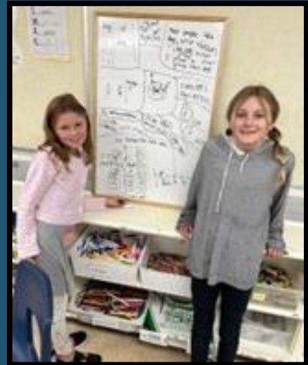
K-3 students use vertical surfaces to collaborate on rich numeracy tasks at Marysville Elementary School

The staff have enjoyed working and learning together and more collaborative task days are being planned for 2025.