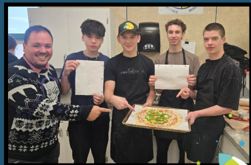
Selkirk Chemistry 11 learners demonstrate their learning in the kitchen!