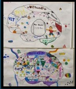
With a focus on the uniqueness of their own brains, students are learning to value diversity at Nicholson Elementary.

At Nicholson Elementary School, one of the schoolwide goals is for students to learn about themselves as unique individuals and value diversity in themselves and others. With a November focus on Neurodiversity, the theme was ‘Everyone’s Brain Looks Different’. Teachers used a variety of text resources and videos to support their lessons on how our brains are different, leading to rich class discussions about the similarities and differences between our brains.